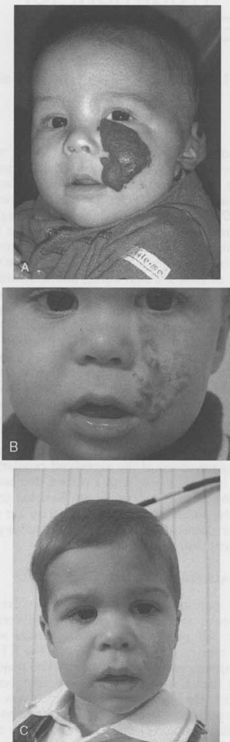
Fig 1 (A) A six-month-old infant with large facial hemangioma at the start of treatment. (B) Patient at end of intralesional KTP laser therapy; pulsed dye laser treatments continued. (C) Patient 12 months after end of pulsed dye laser treatments. Note slight skin atrophy and hyper pigmentation.

introduced, through an 18-gauge IV catheter inserted into unaffected skin 1–2 cm from the lesion. It was subsequently directed into the deep portion of the hemangioma. Great care was taken to stay at least 5 mm below the surface. Rapid radial passes were made throughout the lesion until there was palpable warming of the lesion, which served as the end point of treatment. The passes were made in multiple planes to include the entire volume of the lesion. Any superficial component was treated with a single pass of the pulsed dye laser at the same time. At the end of the procedure, the deep component was injected with 0.125% mepivacaine, 5% Kenalog solution. No more than 1.5 cc per lesion was injected. Power settings for the KTP laser ranged from 2 watts to a maximum of 5 watts. Power ranges for the tunable dye laser ranged from 6 joules up to a maximum of 15 joules. All lesions were coated with a topical antibiotic cream and the patients were discharged with no medications. Treatment intervals varied between four and six weeks. Four weeks was used in rapidly growing lesions impinging on the eyes, mouth or nose while six week intervals were applied to slowly growing lesions which did not have an immediate functional significance.