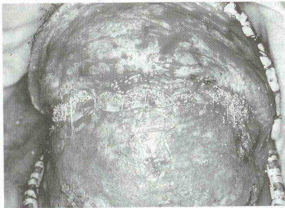
Fig. 3: Intraoperative photograph of patient in Fig. 1 with vascularized periosteal flaps closed over P.H.A. paste.

good contours of the P.H.A.-filled defects, maintenance of implant volume, and nonvisible interfaces between P.H.A.-grafted areas and the native bone (Fig. 1-3). We were able to examine the P.H.A.-grafted areas in three patients who underwent other procedures 9-18 months after P.H.A. placement. In all three cases there were visible bony ingrowth into the consolidated P.H.A. and bleeding from the P.H.A. surface.