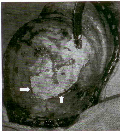
Fig. 2. Intraoperative view of patient in shown in Figure 1. Hydroxyapatite cement is applied to the mesh suprastructure until it is flush with the surrounding bone. Arrows show the feathering of the cement onto the surrounding bone.

pattern. The areas of contour deficit or irregularities were carefully mapped and marked before injection of diluted bupivacaine and epinephrine. Subgaleal dissection was carried out, with as much of the periosteum preserved as possible, to expose the areas of interest. Once the area of interest was reached, a large flap of pericranium was elevated to expose the underlying skull. If the temporal areas were to be augmented, the temporalis mus-